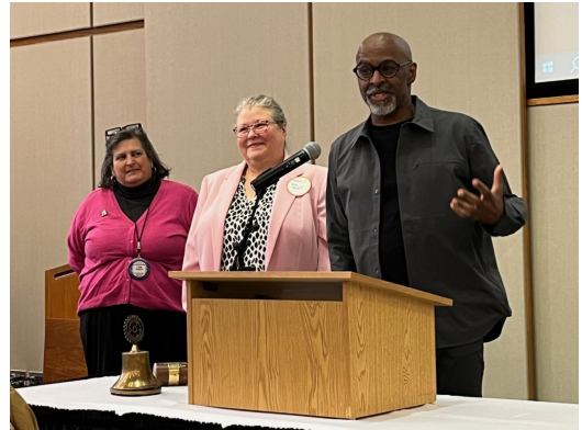
The full report will be available on the CultureWorks website.